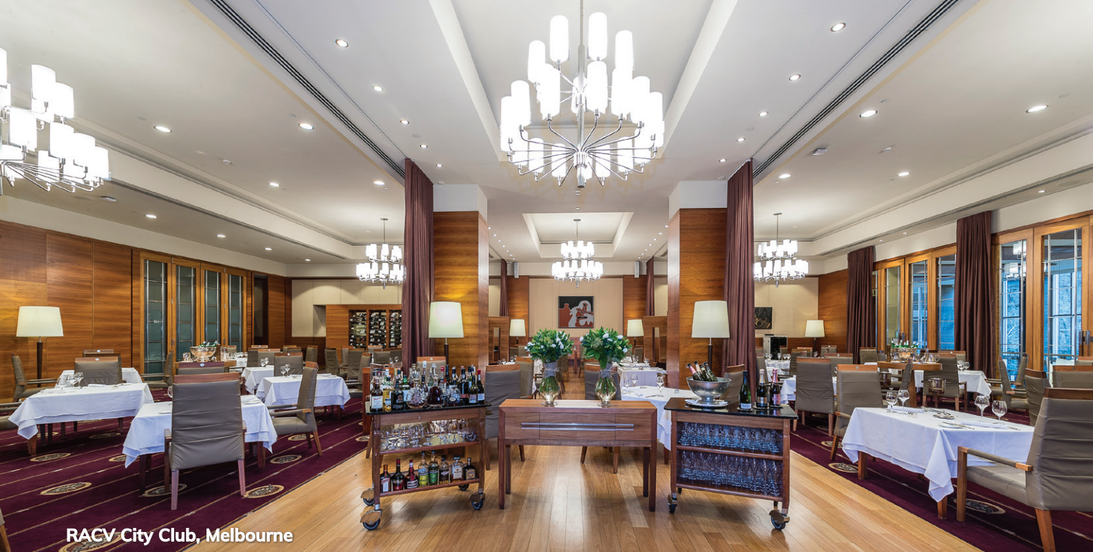
RACV City Club, Melbourne