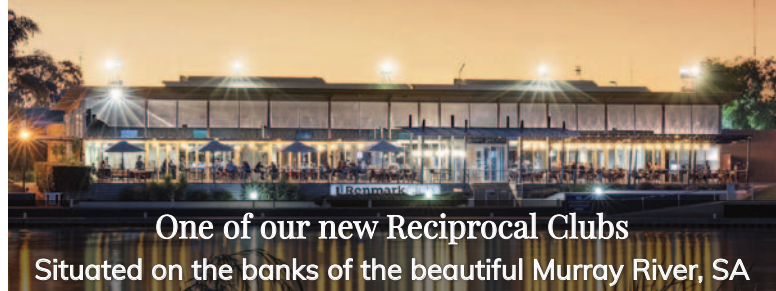
One of our new Reciprocal Clubs Situated on the banks of the beautiful Murray River, SA