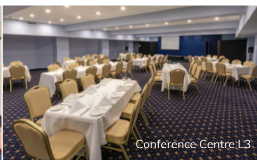
Conference Centre L3