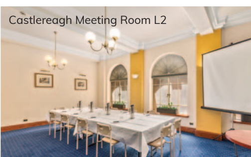
Castlereagh Meeting Room L2