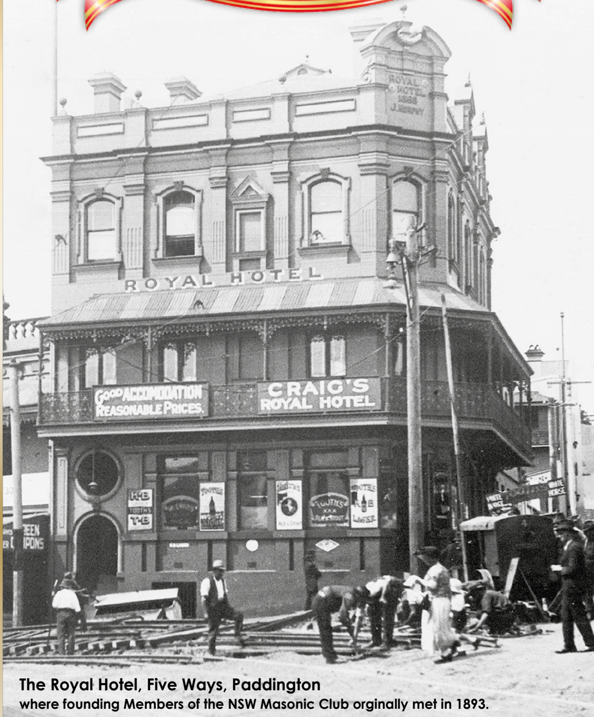
The Royal Hotel, Five Ways, Paddington where founding Members of the NSW Masonic Club originally met in 1893.