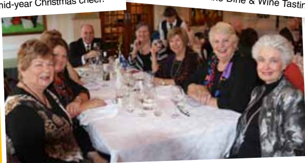
Guests enjoy the wonderful food and atmosphere at the Royal Commonwealth Society Lunch