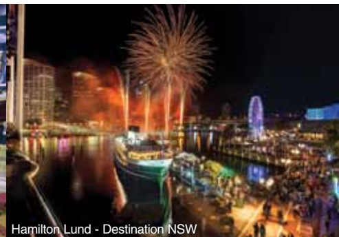
Hamilton Lund - Destination NSW