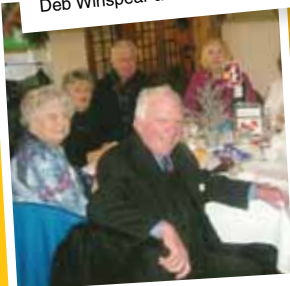
The Touring Group share some mid-year Christmas cheer!