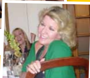
Actress Amanda Muggleton enjoys a laugh at the Glugs lunch