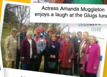
Member's of the Touring Group enjoy a day out on the road