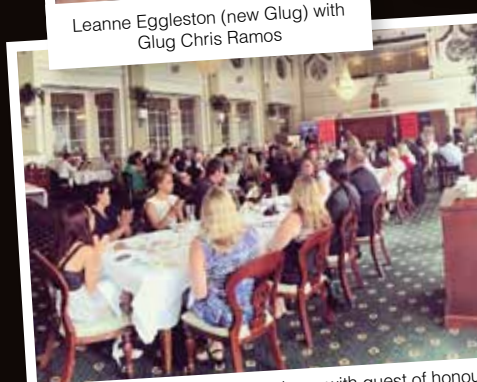
The Sydney Rotary enjoys luncheon with guest of honour, His Excellency General The Honourable David Hurley AC DSC Governor of New South Wales