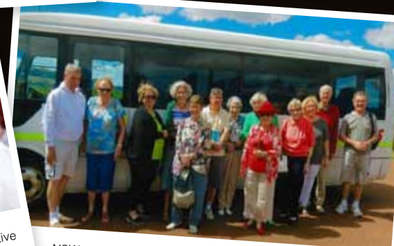
NSW Masonic Club Touring Group splashes a little colour on the landscape during their trip to Margaret River

"YOU CAN'T HAVE A CENTRAL BUSINESS DISTRICT WITHOUT BUSINESS?"