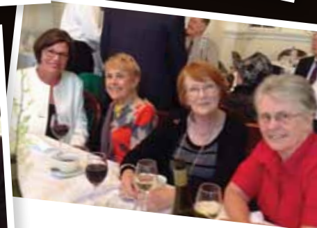
The four sirens ?????????