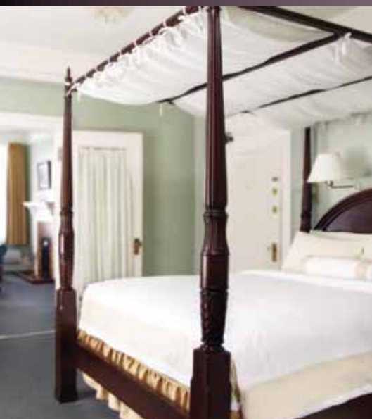
The Union Club of British Columbia