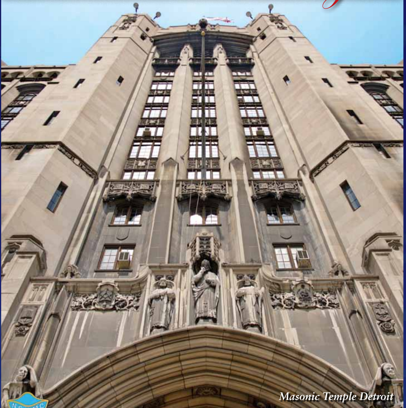
Masonic Temple Detroit