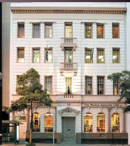
The Western Australian Club