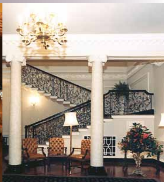
Royal Overseas League - London