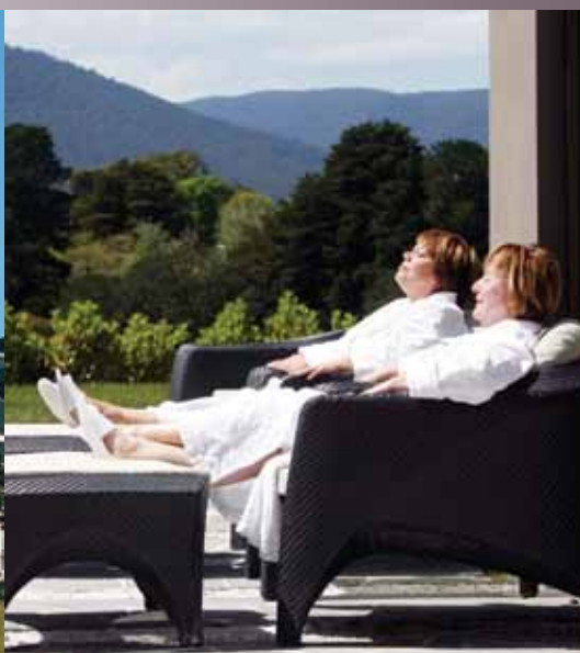
RACV Healesville Country Club