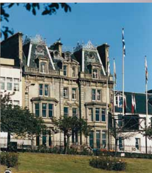
Royal Overseas League - Edinburgh