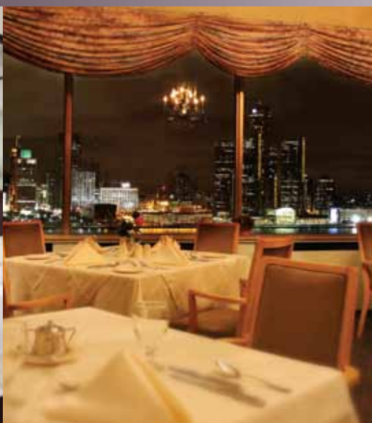
The Windsor Club