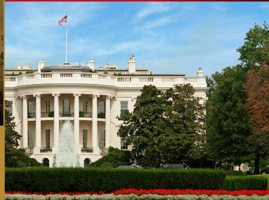
The White House, Washington DC, featuring the Truman Balcony

In 1945, he was made a 33° Sovereign Grand Inspector General and an Honorary Member of the supreme council at the Supreme Council A.A.S.R. Southern Jurisdiction Headquarters in Washington D.C. In 1959, he was awarded the 50-year award.