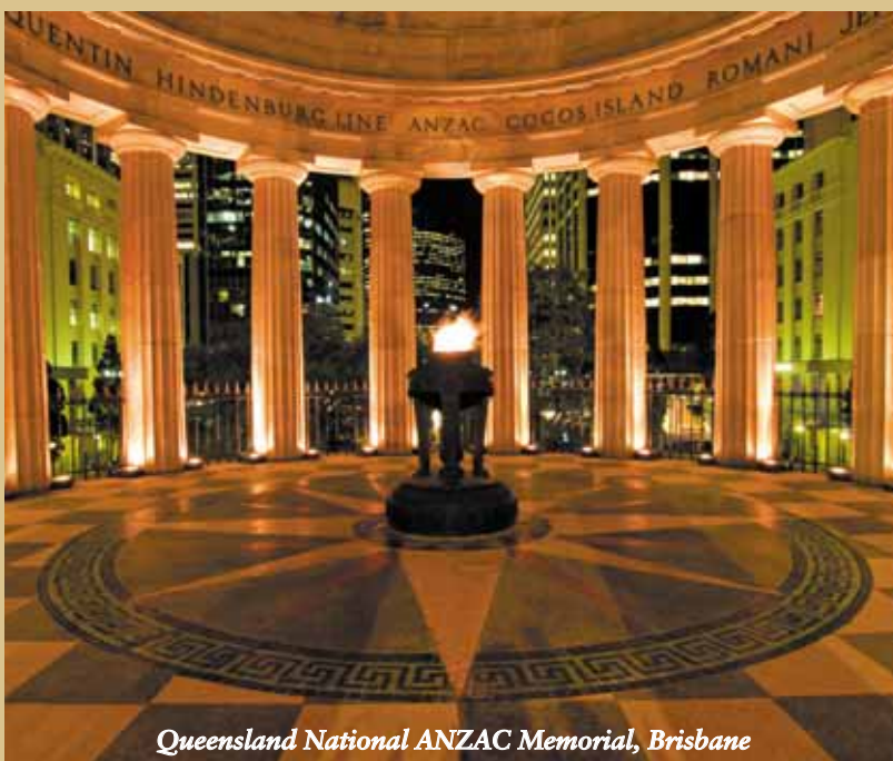
Queensland National ANZAC Memorial, Brisbane