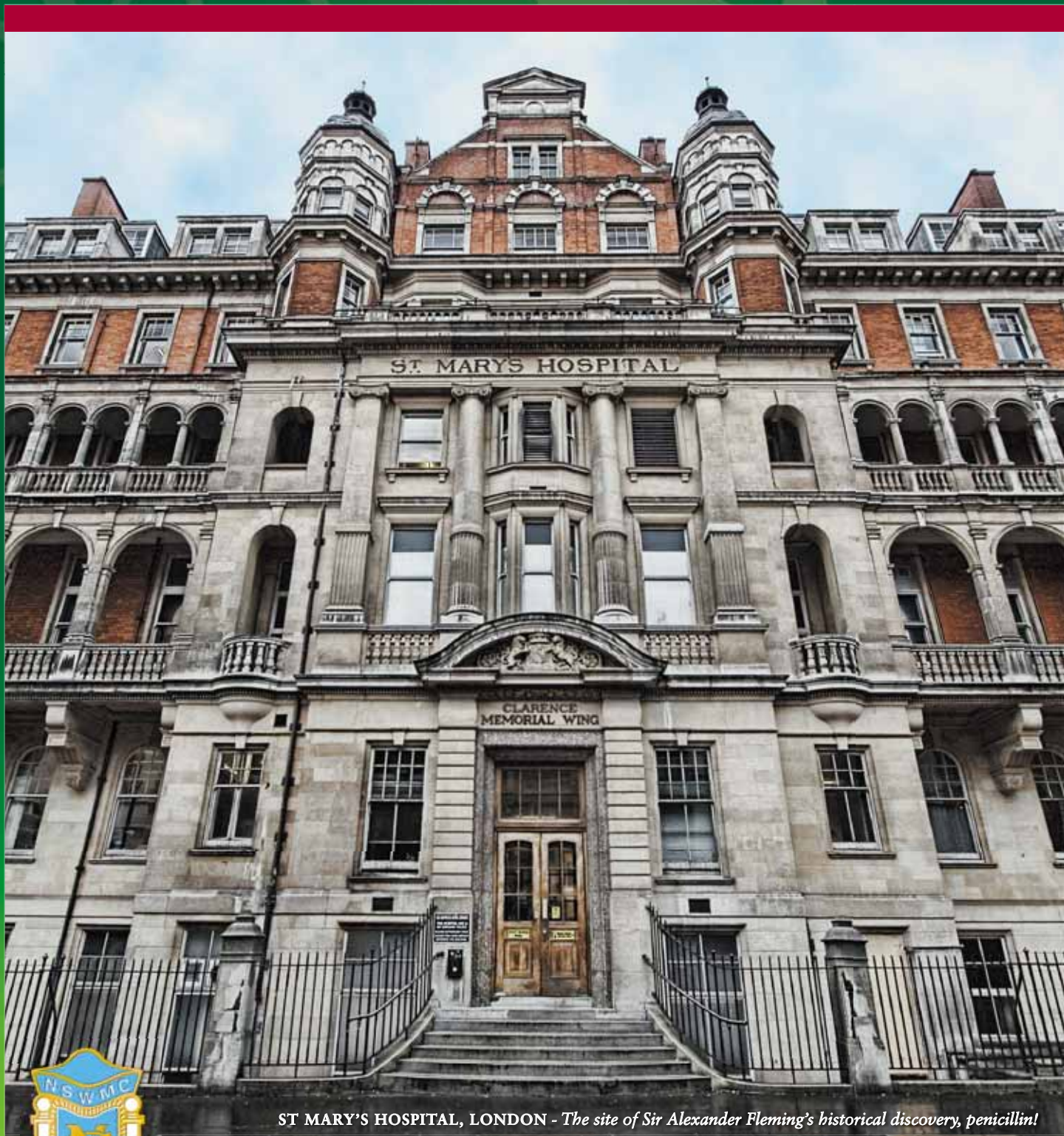
ST MARY'S HOSPITAL, LONDON - The site of Sir Alexander Fleming's historical discovery, penicillin!