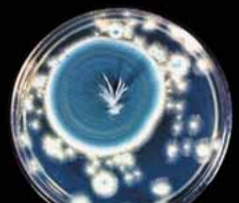
Above left: Penicillium mould, spore production, SEM, Scanning electron micrograph of Penicillium mould producing chains of spores. Above Right: Petri dish culture penicillium notatum, Penicillin mould.