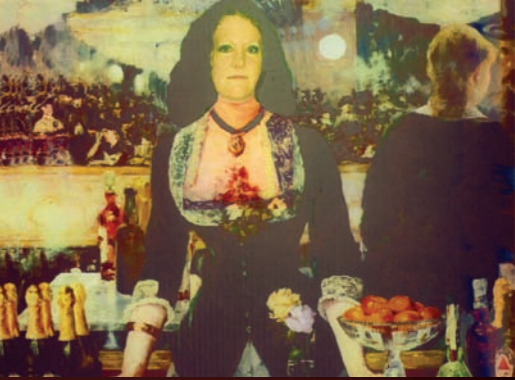
La jeune fille au bar du Folies Masoniques