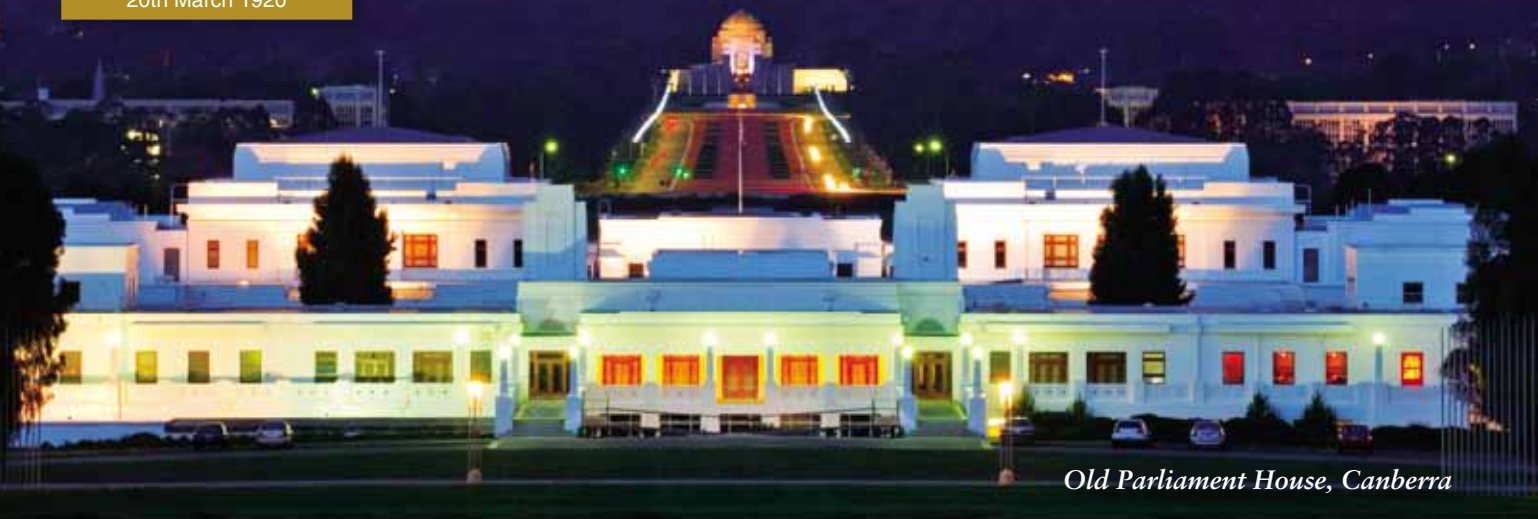
Old Parliament House, Canberra

Robert Gordon Menzies was born on 20 December 1894 at Jeparit, Victoria, where his father was a storekeeper.