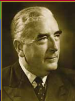
Initiated in the Austral Temple Lodge No. 110, Victorian Constitution 20th March 1920