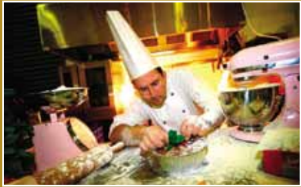
SMH - Shoot the Chef Competition