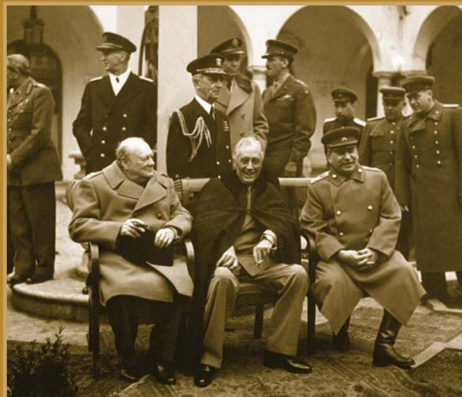
Yalta Conference, the last meeting of the World War II "Big Three," held February 7–12, 1945, at Yalta, in the Soviet Union. President Franklin D. Roosevelt of the United States, Prime Minister Winston Churchill of Great Britain, and Premier Joseph Stalin of the Soviet Union discussed strategy for ending the war and made plans for the postwar world.

Churchill became Prime Minister again in the Conservative victory of 1951 and resigned in 1955.