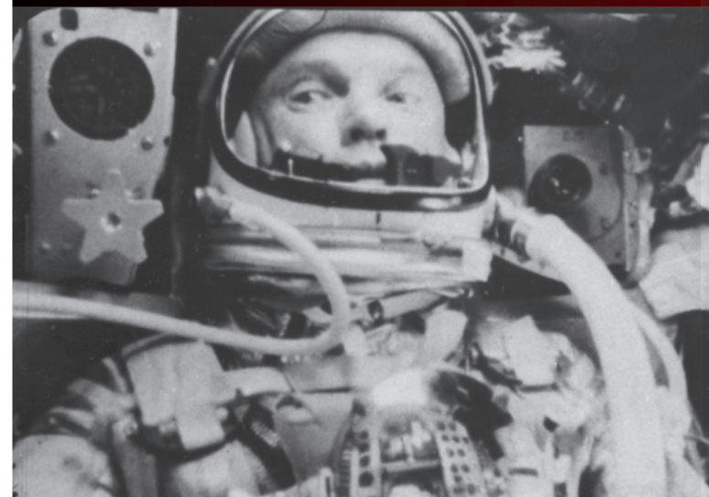
Astronaut John Glenn photographed in space by an automatic sequence motion picture camera during his flight on "Friendship 7." Glenn was in a state of weightlessness traveling at 17,500 mph as these pictures were taken