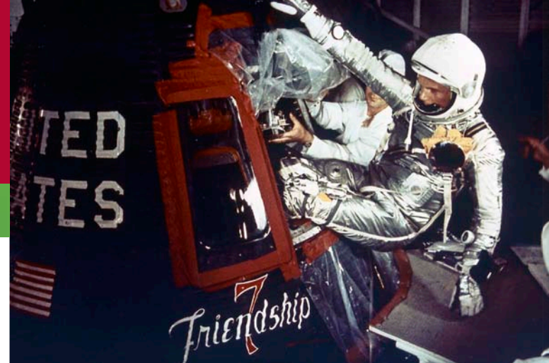
Astronaut John Glenn, Jr., as he enters into the spacecraft Friendship 7 prior to MA-6 launch operations at Launch Complex 14. Astronaut Glenn is entering his spacecraft to begin the first American manned Earth orbital mission.