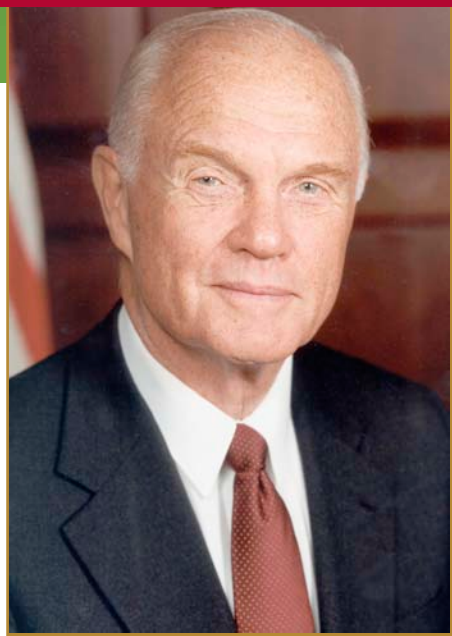
Concord Lodge 688, New Concord, Ohio