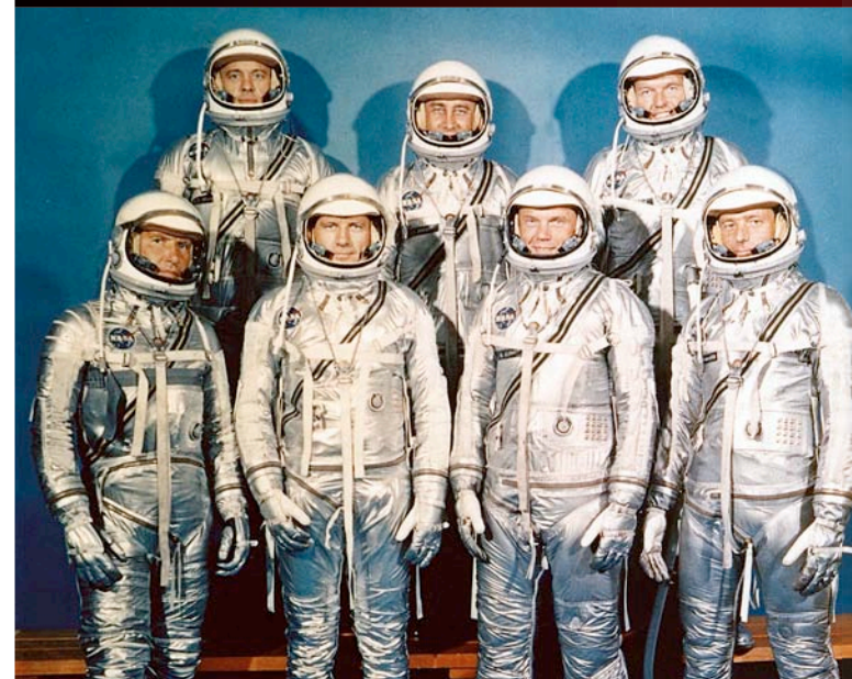
The original Mercury 7. From left to right: Walter M. Schirra Jr.; Alan B. Shepard, Jr.; Donald K. 'Deke' Slayton; Virgil I. 'Gus' Grissom; John H. Glenn, Jr.; L. Gordon Cooper and M. Scott Carpenter. 'Deke' Slayton is the only one to never fly an actual mission.