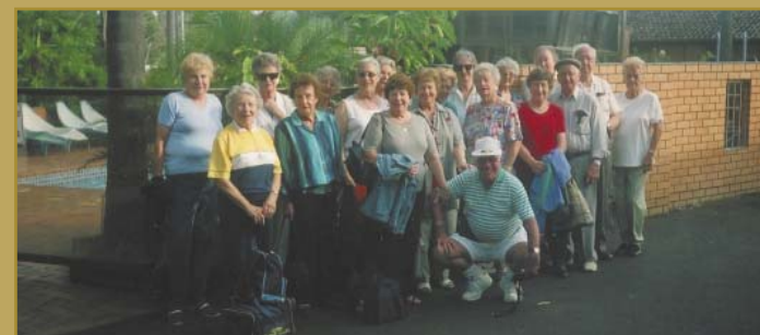
Members of the Touring Group on their recent trip to Port Macquarie

Included: Accommodation at Yass Sundowner Motor Inn - Phone 6226 3188 All meals except lunch on Day 3 Morning teas All entries, tours, inspections Fully escorted and commentated Coach travel